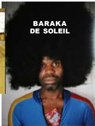
BARAKA DE SOLEIL